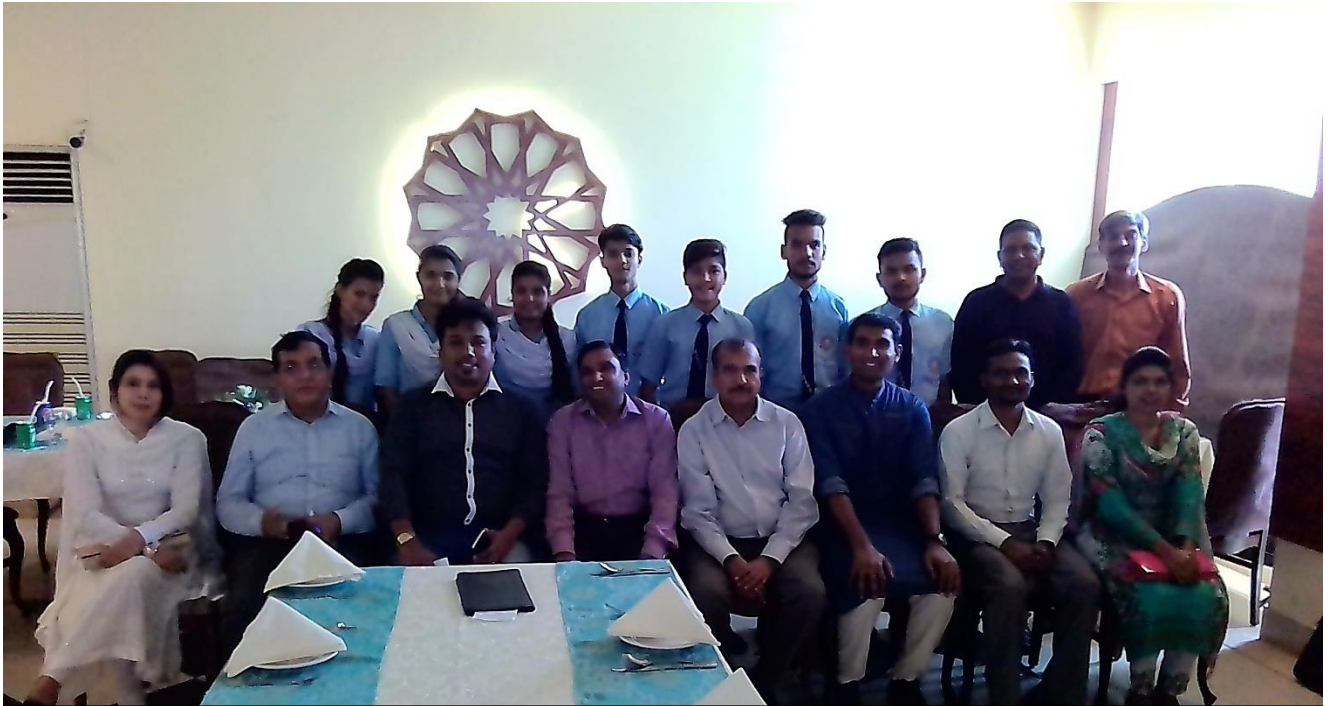
Group Photo of the STP official with the delegation of All Saints High School, Karachi